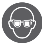
Wear eye protection