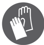
Wear protective gloves