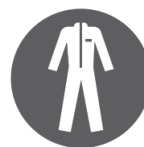
Wear protective clothing