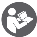
Refer to instructions

IMPORTANT: PLEASE READ THESE INSTRUCTIONS CAREFULLY. NOTE THE SAFE OPERATIONAL REQUIREMENTS, WARNINGS & CAUTIONS. USE THE PRODUCT CORRECTLY AND WITH CARE FOR THE PURPOSE FOR WHICH IT IS INTENDED. FAILURE TO DO SO MAY CAUSE DAMAGE AND/OR PERSONAL INJURY AND WILL INVALIDATE THE WARRANTY. KEEP THESE INSTRUCTIONS SAFE FOR FUTURE USE.