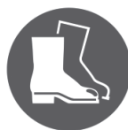
Wear safety footwear